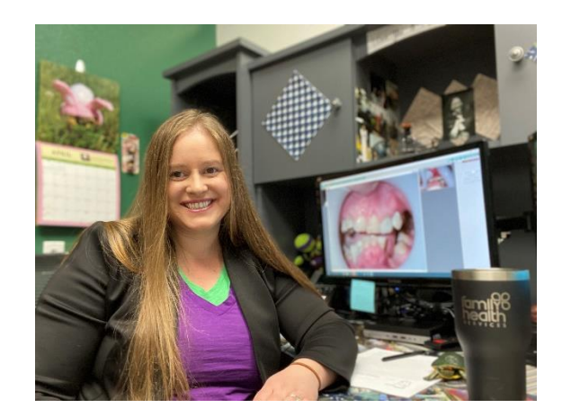
Thank you for reviewing my CV